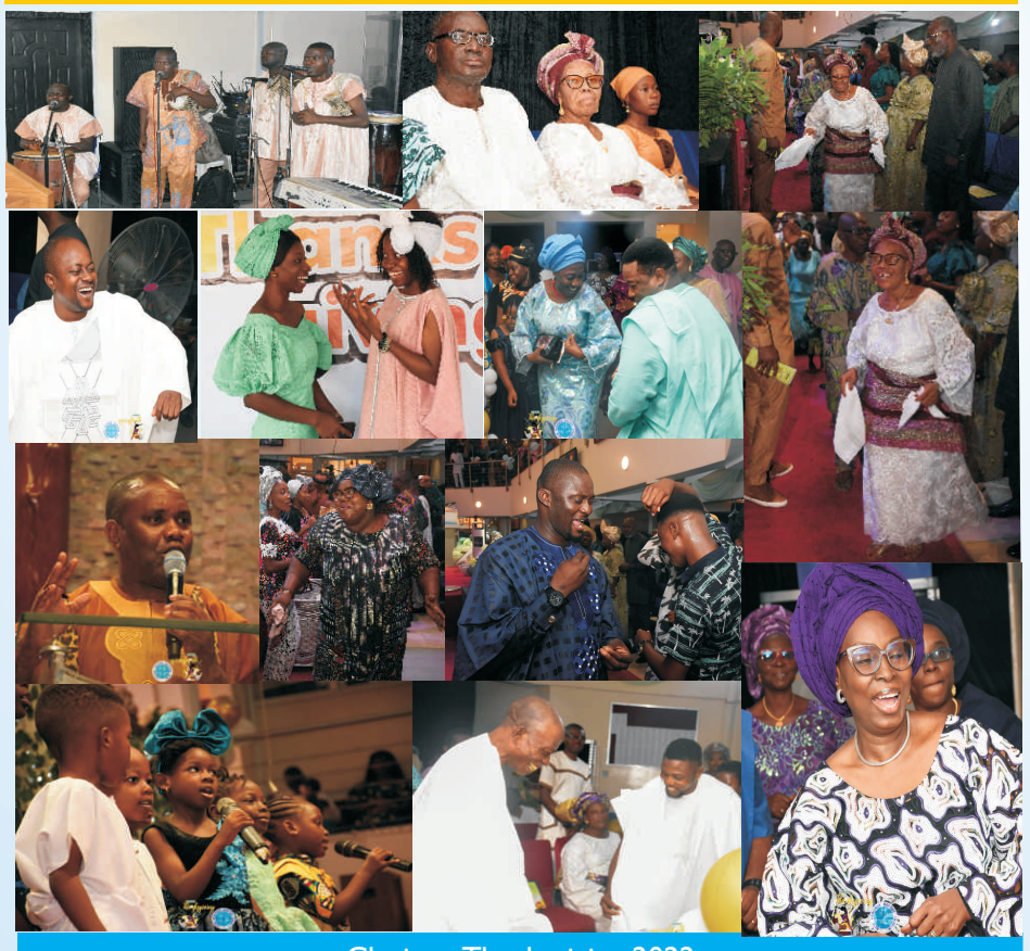
Glorious Thanksgiving 2022