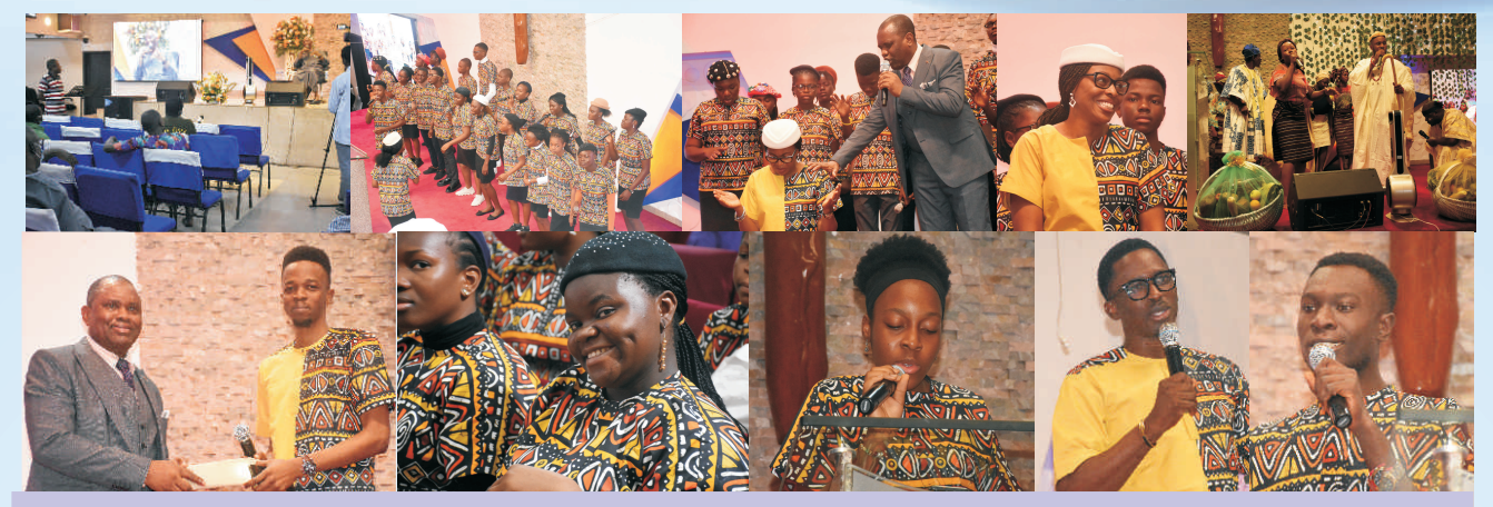
NHBC 2022 Teenagers Week